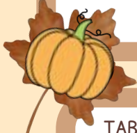
TABLE OF CONTENTS/ တါဂ့ၤခိဉ်တီတဖဉ်